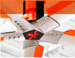
Superior cast hub provides full blade support for added safety.