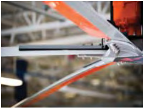
Spot cooling solution.