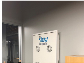
Branded for your company.